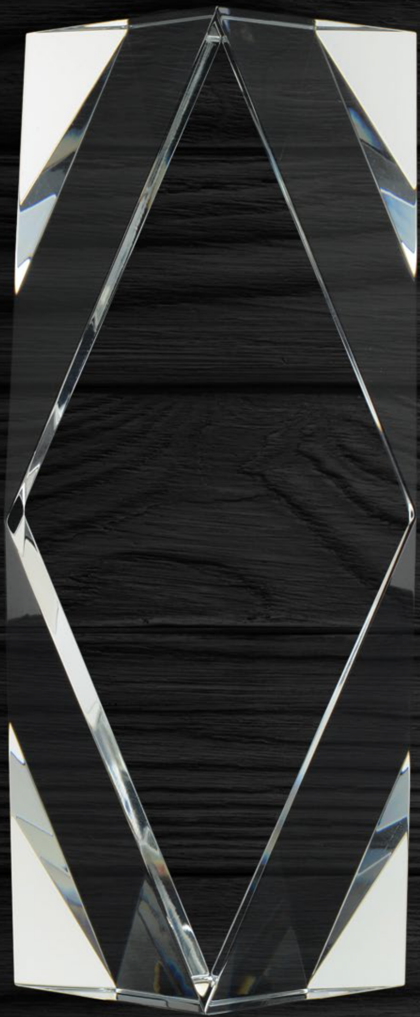
Sample of Engraved Award